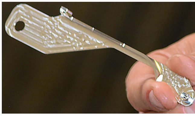
Production component programmed with hyperMILL®

With hyperMILL® you're able to simulate not only the part in its fixture, but the tool, the tool holder, the spindle and the entire machine envelope.