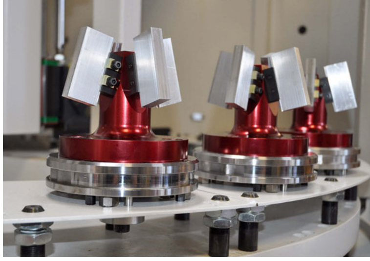
5-axis workholding fixtures are now a substantial part of 5th Axis' business.